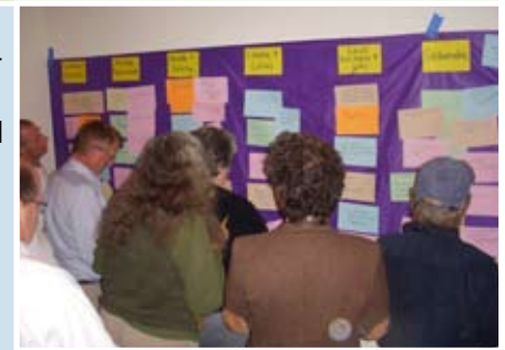
Tier 1 Projects PAC Recommended Projects (Late April 2013)